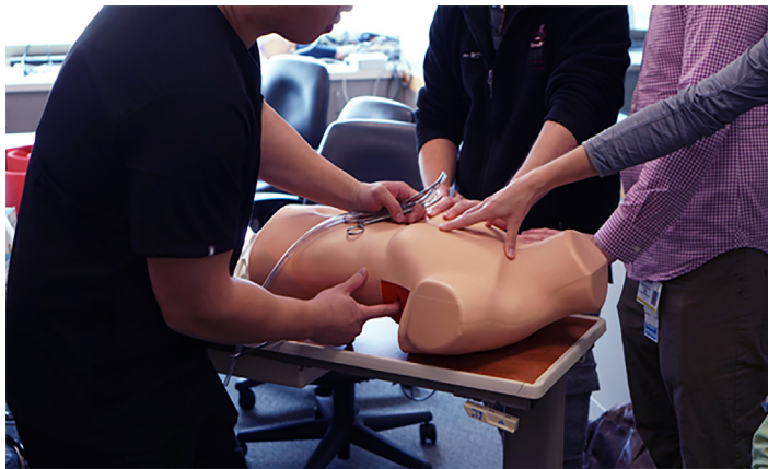
Figure 3. The Yogaman chest tube model in use.

to hold the model down. Alternatively, gaffer tape run from one side of the gurney or table across Yogaman's waist to the other side can also act as an anchor. We created a second YouTube video to demonstrate Yogaman in use ( https://youtu.be/oLp74QCKBgw ).