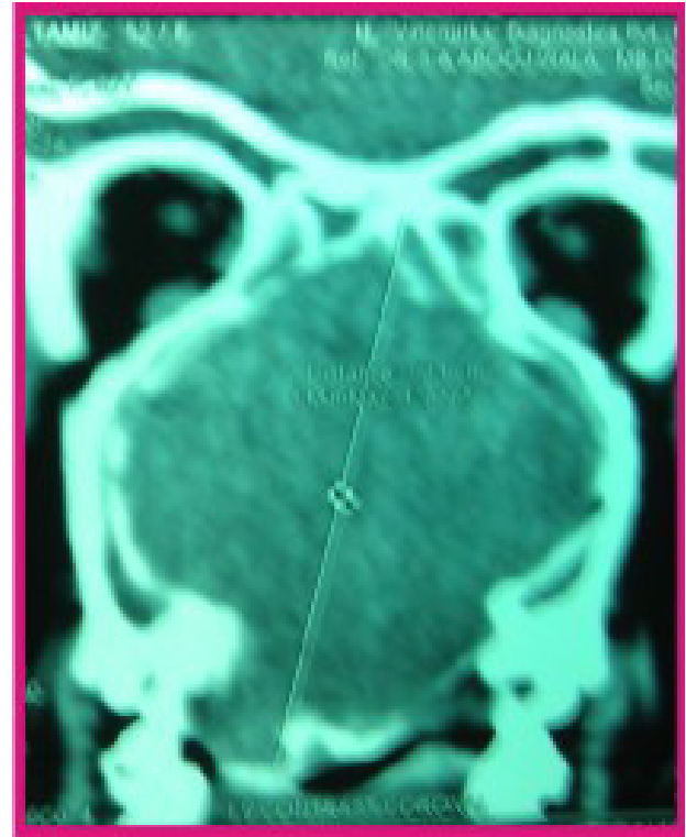
Figure 2 Contrast enhanced CT scan (coronal view) showing an oval lobulated iso-dense mass measuring about 7.0 x 5.0 cm confined to the nasal vault and the ethmoids.

Only three cases of sinonasal myoepithelioma have been reported in the literature so far. [3-5] The CT imaging appearance of myoepithelioma (a well-defined enhancing mass) is not specific. [5]