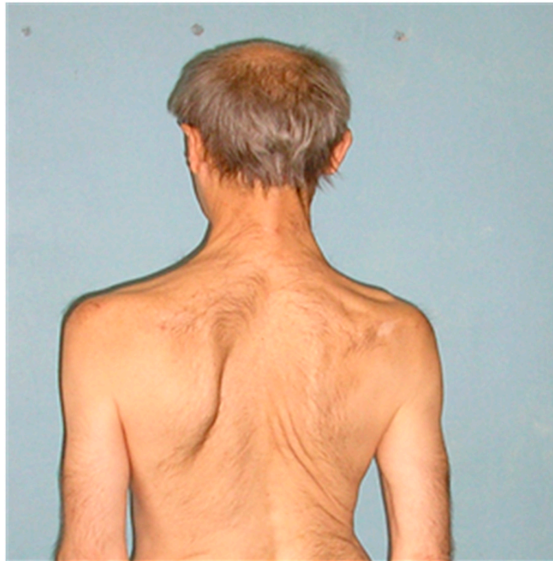
Figure 1. Hypotrophy of the shoulder girdle and neck muscles is clearly visible on the right side. The left scapula is winged.

The patient's neck muscles were atrophic, especially mm. sternocleidomastoideus on both sides. His head was hanging forward. Pronounced fasciculations and fibrillations were observed at rest in the proximal muscles of the upper extremities. The strength of the hands in the distal sections was preserved. Tendon reflexes of the hands were not increased. The patient was able to walk independently, and his gait was not impaired. Range of motion and strength in the legs were normal. Sensitivity disorders were not identified.