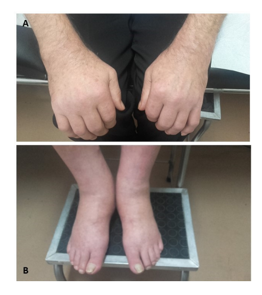
Figure 2. A 65-year-old male with renal cell carcinoma developed diffuse, painful swelling of hands ( A ) and feet ( B ), 3 months following nivolumab treatment.

Figure 1. Main immune checkpoint inhibitor (ICI)-induced rheumatic syndromes.