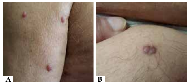
FIGURE 1: Adult multiple xanthogranuloma. A. Detail of papule-nodular, brown and erythematous-violaceous lesions, asymptomatic, in the right arm. B. Detail of lesions on the right thigh

No alterations were observed in the complementary evaluation, which included: hemogram with leukogram; blood biochemistry; electrophoretic proteinogram and serum immunofixation; urinalysis, diuresis monitoring and pituitary hormone study; skeletal radiography; electrocardiogram; respiratory function tests; cranio-encephalic and thoraco-abdominopelvic tomodensitometry studies.