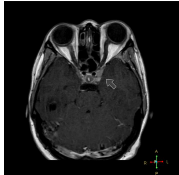
Fig. 1 – Post GAD TIWI MRI orbits axial section reveals a homogeneously enhancing lesion in the lateral wall of the left cavernous sinus reaching the left orbital apex (as depicted by arrow).

Radiological findings in this scan included an extra-axial altered signal intensity lesion in the left cavernous sinus extending into the left orbital apex. The lesion was iso-intense to grey matter on T1W1 and T2WI with homogeneous enhancement on post-contrast images. The lesion was closely abutting the left optic nerve; however, the optic nerve was of standard caliber and showed no altered signals (Figs. 1 and 2). An altered signal intensity extra-axial lesion was also seen in bilateral cerebellopontine angles appearing isointense on T1WI and T2WI with homogenous post-contrast enhancement. It measured 15 × 8 mm on the left side and 12 × 5.5 mm on the