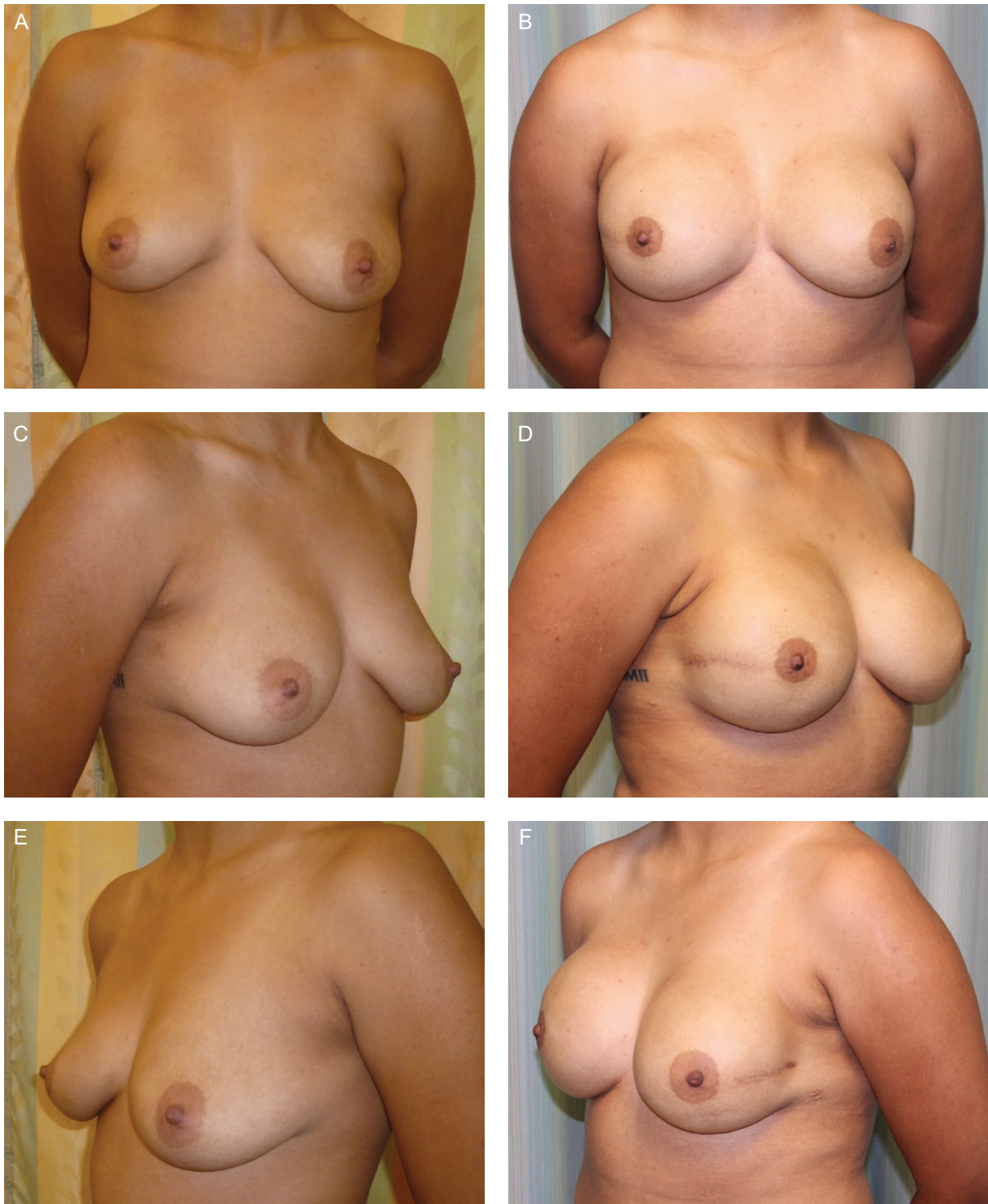
Figure 2. A 25-year-old woman (BMI, 23.87 kg/m 2 ), BRCA2 gene mutation, underwent bilateral prophylactic nipple-sparing mastectomies and immediate bilateral prepectoral DTI breast reconstruction. She has Natrelle Inspira SCX-700 cc implant (Allergan, Inc., Irvine, CA) in the right-side breast, SCX-580 implant in the left-side breast, and underwent fat grafting. (A, C, E) Preoperative and (B, D, F) postoperative views at 13 months postoperatively.