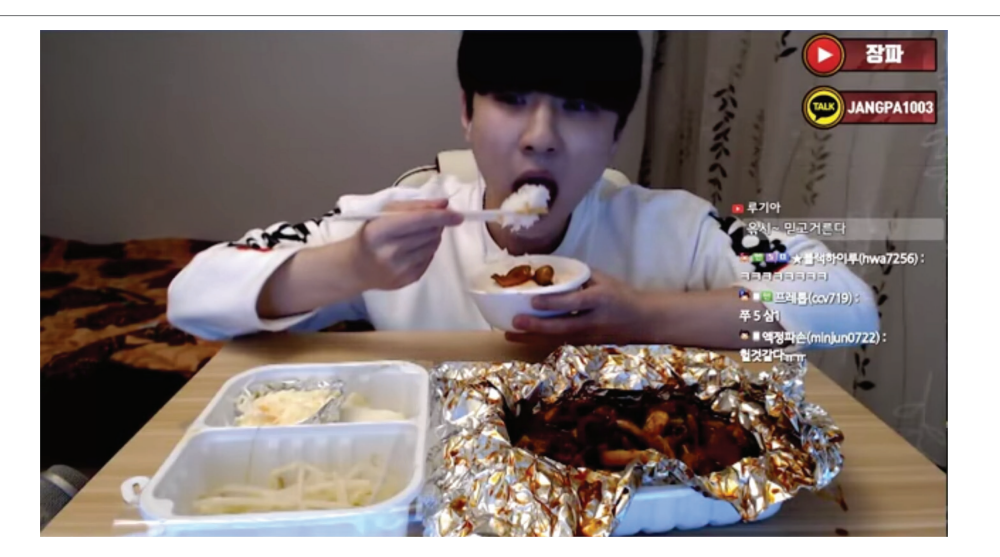
FIGURE 1 In what sense are those who engage in Mukbang involved in a meaningfully social/connected form of dining mediated by digital technology? There are purportedly huge numbers of young Koreans (Kim, 2018; Choe, 2019; though note that Mukbang is also gaining popularity amongst other Asian and Western viewers; Donnar, 2017; Pereira et al., 2019) eating alone while tuning in to a broadcast jockey who are normally reasonably attractive individuals seen eating large amounts of energy dense food (e.g., deep fried chicken wings). This figure shows a still image taken from Korean Mukbang channels (see Vice Food, 2015).