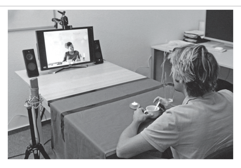
FIGURE 6 | RoomXT, advanced video communication for joint dining over a distance from Heidrich et al. (2012) (figure from Heidrich et al., 2012).

et al., 1985; Caldwell and Hibbert, 2002) and drinking (McElrea and Standing, 1992) speed (see Spence et al., 2019, for a recent review). Once again, it is a case of more research needed.