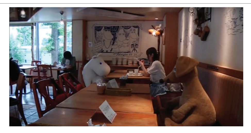
FIGURE 3 | Solo diners eating with a cuddly toy. A new trend in tackling loneliness from one Japanese restaurant (figure reprinted from Fishwick, 2014).

(e.g., Sanghani, 2014)<sup>2</sup>. Note that dining at Eenmaal does not seem to be about stopping by for a bite to eat, but rather actually making a statement by deliberately choosing to eat alone with other solo diners. Separately, there are also projects such as the Eden Project's Big Lunch<sup>3</sup>, which has been running for a few years here in the UK, with the aim being to get as many people as possible to eat with their neighbors on at least 1 day each year. At the same time, in recent years, a number of websites have emerged that help to connect diners, no matter whether or not they are solo. VizEat being one successful example of this approach (e.g., see Eleftheriou-Smith, 2017). While VizEat started out in the UK, several similar sites have since sprung up across the globe, their stated aim, to connect people whenever they happen to be, even when traveling in a foreign country, say (see Rumbelow, 2015). In North America, for instance, the equivalent site is called EatWith4.