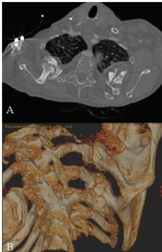
Figure 2. Axial (A) and 3D reconstructed (B) computed tomography scan showing an osteochondroma in the right scapulothoracic space.