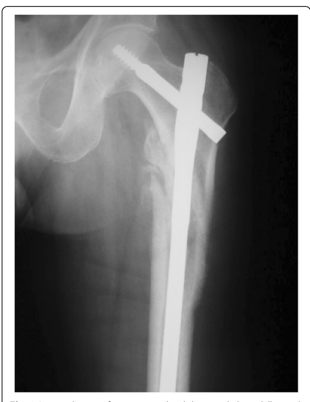
Fig. 2 Intertrochanteric fracture treated with long cephalomedullary nail

This study was an Institutional Review Board approved retrospective cohort study of patients undergoing surgical