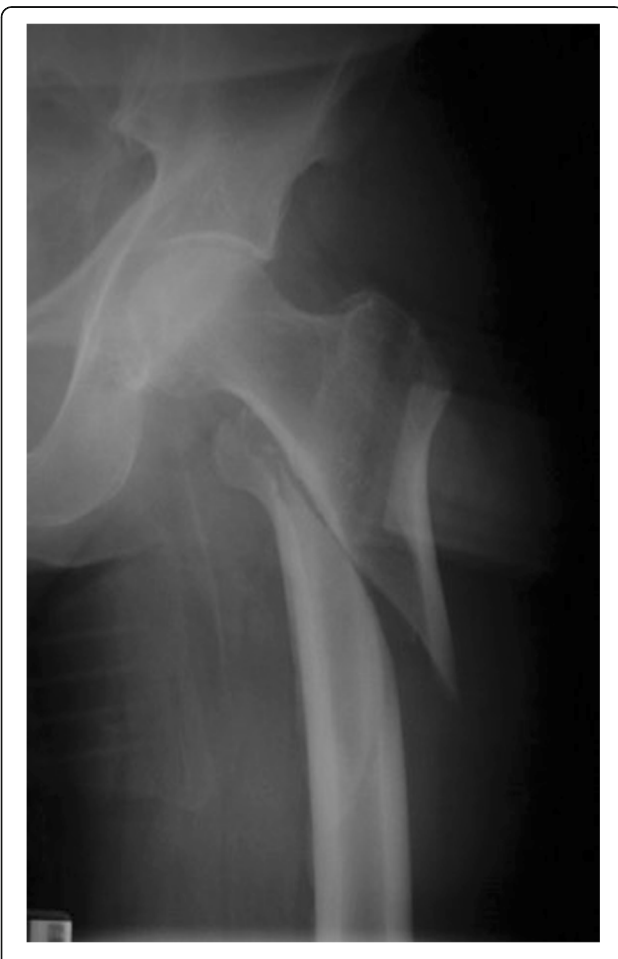
Fig. 1 Reversed oblique femoral fracture type 31 A 3.1

Approximately 300,000 hip fractures occur in the USA each year [1, 2] with 40–45% being in the trochanteric region [3, 3]4]. In an effort to decrease the morbidity and the cost of treatment of these fractures, surgical techniques need to be optimized [5, 6]. The unique anatomy and the occurrence of high varying forces in the trochanteric region of the femur are challenging and demand sophisticated surgical treatment [7–9]. According to the Orthopedic Trauma Association (OTA)/Arbeitsgemeinschaft für Osteosynthesefragen (AO) pertrochanteric fractures run obliquely from the greater trochanter to the lesser trochanter (31 A1 and 31 A2) [10, 11]. This allows controlled impaction of the fracture site in compression hip screws and most intramedullary nailing systems [12]. Intertrochanteric fractures (type 31 A3 following the OTA/AO classification) [10, 11] have unique anatomic and mechanical characteristics and have been traditionally considered unstable [13, 14]. The OTA/ AO type 31 A3 fractures are characterized by having a fracture line exiting the lateral femoral cortex distal to the vastus ridge [15]. Resulting in a fracture line that runs transverse or reversed oblique (Fig. 1) and leads to