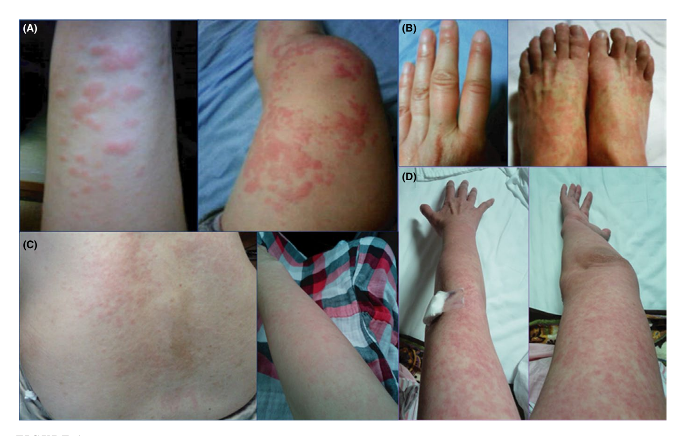
FIGURE 1 The various rashes seen in our patient: A, urticaria of the arms and legs; B, erythema and swelling of the fingers; C, pink rash on the back and salmon-pink rash on an arm before admission; and D, erythema multiform of the upper limbs on the fourth day of fever

To screen for oral infection, she was referred to a dentist, and no infection was evident. However, her third molar was extracted prophylactically 10 days after admission. About