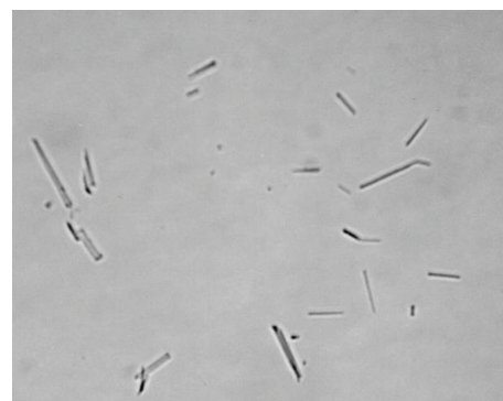
FIGURE 2: Microscopic view of crystal growth in acetaminophen suspension ( F_6 ) (magnification \times 40 ).

The authors do not have a direct financial relation with the commercial identities mentioned in their paper.