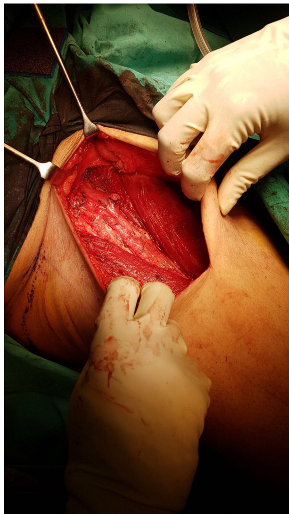
Fig. 1. Identification of femoral canal.

The optimal treatment for recurrent ilioinguinal lymph node metastasis from anal squamous cell carcinomas has been well-established. The National Comprehensive Cancer Network (NCCN) has established that for patients with complete remission after initial therapy, inguinal node palpation and imaging of the pelvic region should be done on a regular basis for follow-up. Should there be a recurrence in the inguinal lymph nodes, groin dissection would be the recommended surgical option. There should also be consideration for adjuvant combined modality therapy, especially if there has been no previous radiotherapy to the groin region. The benefits of this approach can be seen in the retrospective study