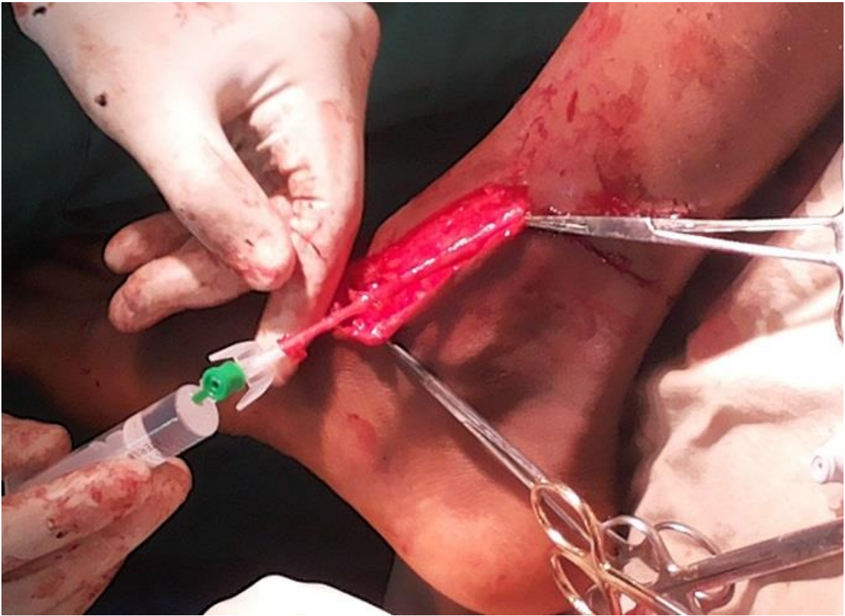
Figure 2: Greater saphenous vein harvest