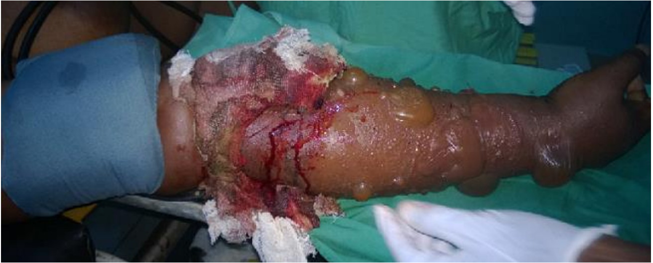
Figure 1: Injured forearm