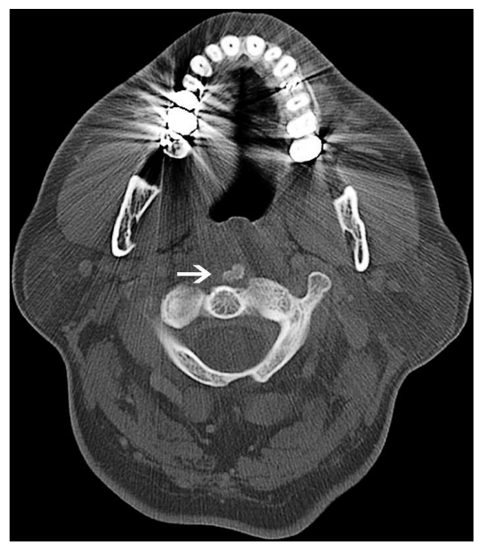
Figure 2. Neck computed tomography bone windows demonstrate the abnormal prevertebral calcium deposit.

The exact pathogenesis of the condition is unknown, although it is believed to be similar to other forms of tendinitis that occur in the body owing to hydroxyapatite deposition, dystrophic calcification, and subsequent inflammatory response.<sup>4</sup> In particular, it is strikingly similar in epidemiology, pathogenesis, and clinical course to the equally obscure "crowned dens syndrome," which involves calcification of the