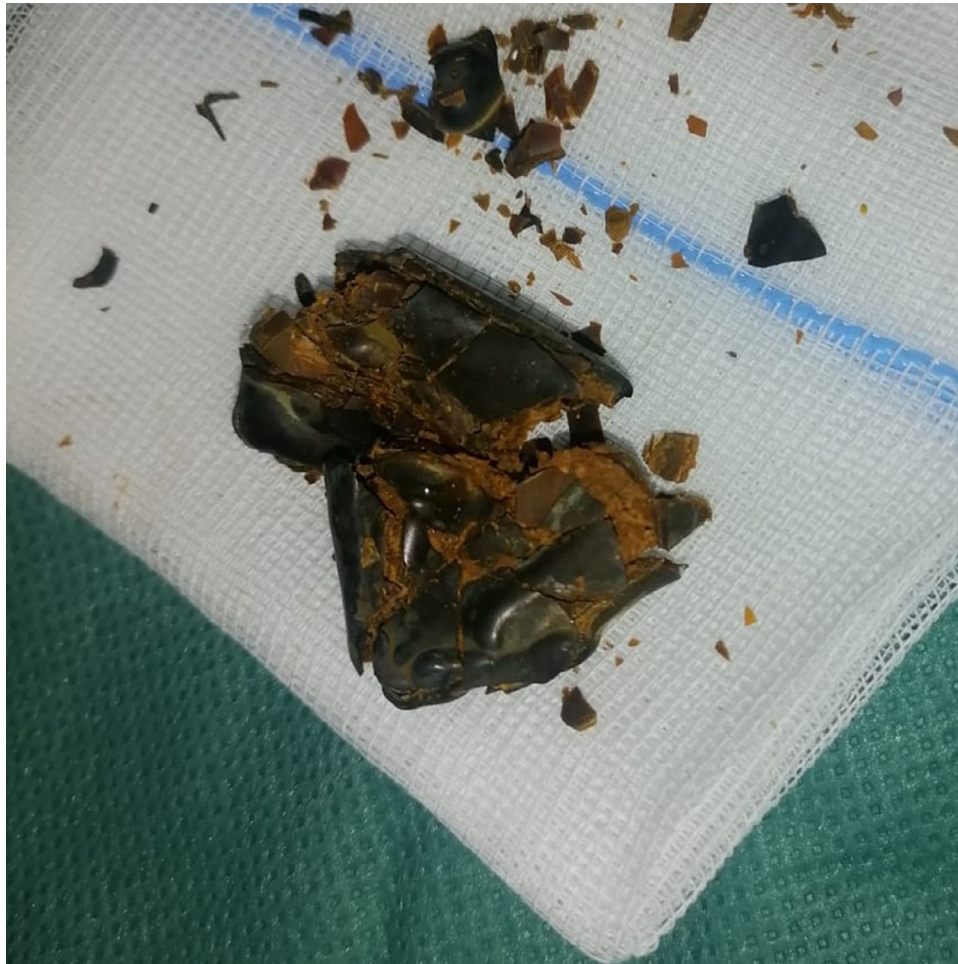
Fig. 2 – Photography of the fragmented enterolith.