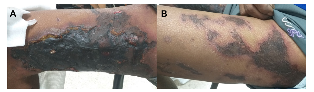
Fig. 2. Clinical photographs show progressive large painful necrotic skin on both thighs. (A, the right inner thigh; B, the left lateral thigh).

In patients with calciphylaxis, clinical suspicion is important for early diagnosis. Many disorders mimic calciphylaxis, including ecthyma gangrenosum, warfarin-induced skin necrosis, atherosclerotic