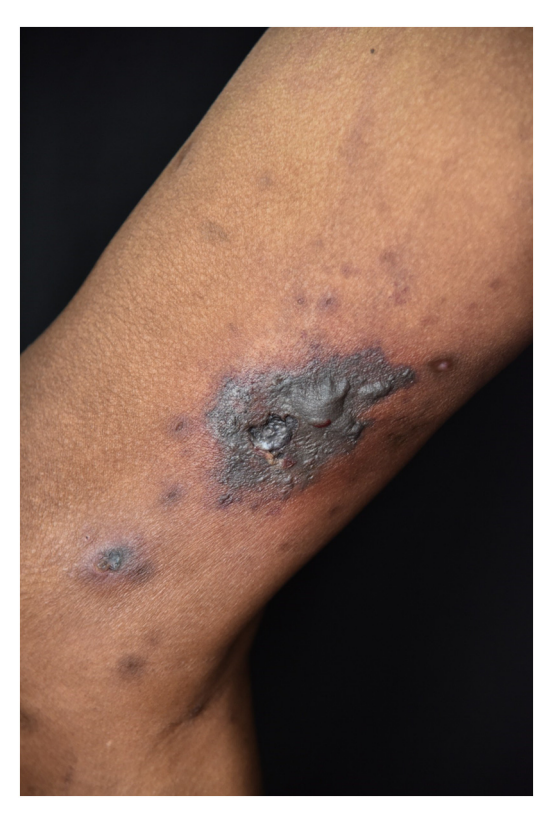
Fig. 1. The clinical photograph shows a localized, painful, necrotic skin on the right inner thigh.