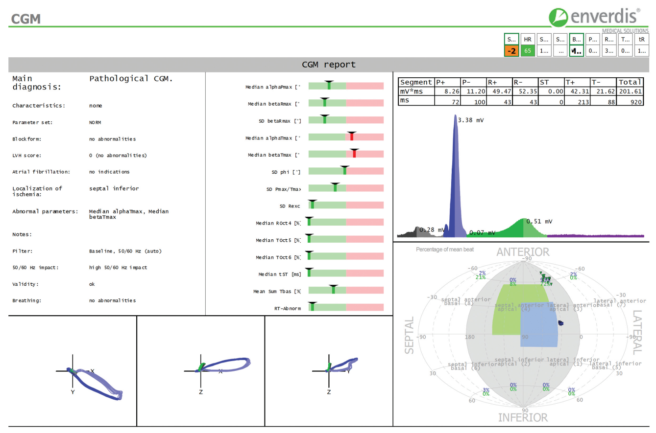
Figure 4. 3D ECG /Cardiogoniometry performed to the patient shows septal inferior myocardial ischemia.