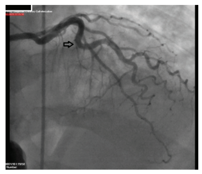
Figure 2. Emergency coronary angiography of the patient shows 30-40% stenosis in the left anterior descending artery.

to this, the left main coronary artery, left circumflex artery and right coronary artery were observedly normal (Figure 2). ST segment elevation regressed in the ECG of the patient, who had no more ischemic cardiac symptoms after the intervention (Figure 3).