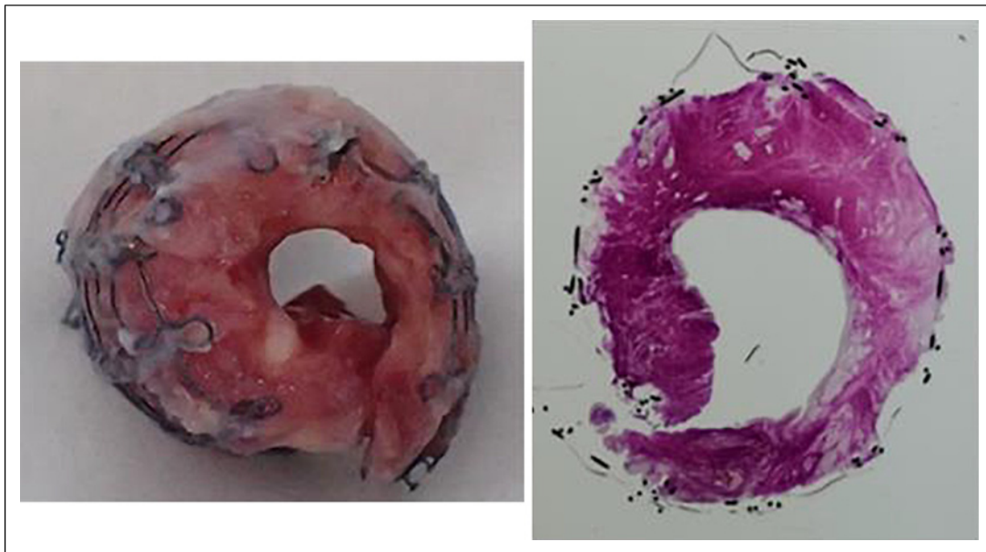
Fig. 3. Macroscopic and microscopic (HE staining) of the extracted metallic stent. Extreme granulation is observed in the lumen.

performing a tracheostomy and cutting into the tumor might have been a choice. However, the decision of placing a metallic tracheal stent seems to be an appropriate strategy. The major reflection of this case may be the delay of removing the stent which was no longer needed. It is important to determine the timing of stent removal once the primary disease causing the stenosis has been treated. Alazemi et al. [5] reported that endoscopic removal of a metallic stent is feasible with no major complications when removed within 30 days of insertion. Removal after long-term placement (over 30 days) was associated with complications including re-obstruction, ventilation problems, and airway re-stenting. Multidisciplinary team discussions including those with otolaryngologists, medical oncologists, and respiratory surgeons, are mandatory for managing tracheal stenosis. It is necessary to predict the long-term outcomes of the stenosis based on the pathology of the disease and to select an appropriate method to secure the airway.