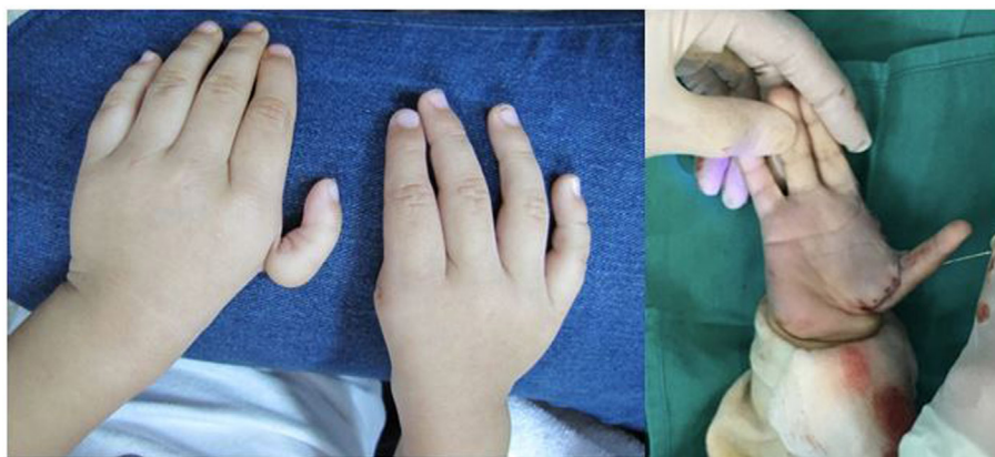
FIGURE 6 | Bilateral thumb hypoplasia with a severely underdeveloped thumb on the left hand and an absent thumb on the right hand. This patient was treated with pollicization on both hands, in a staged fashion, which involves reconstructing and repositioning the index finger to function in the position of a thumb.