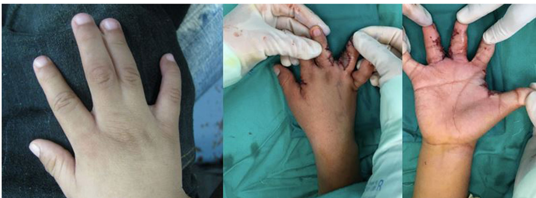
FIGURE 4 | Syndactyly (webbed digits) affecting the ring and long fingers treated with syndactyly release and skin grafting.