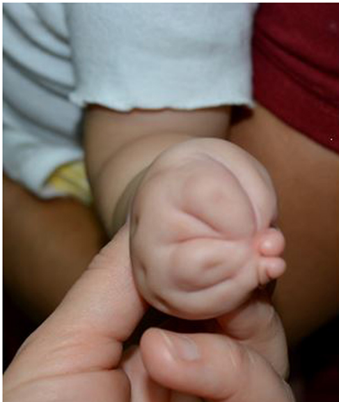
FIGURE 5 | Constriction band syndrome resulting in a complex syndactyly of the fingers.

The disparity between the need for surgical care and its availability in resource-poor countries is substantial, which has far reaching consequences for individual, social, political, and economic