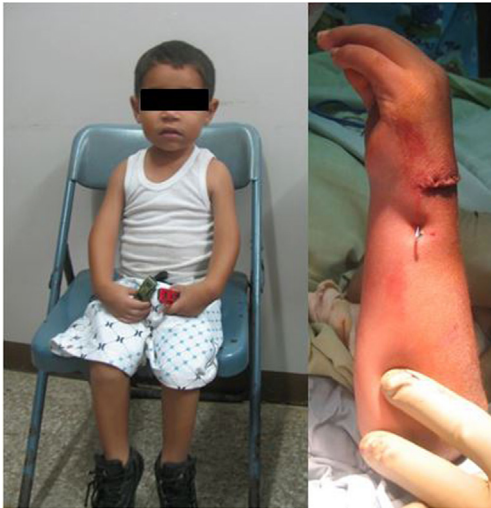
FIGURE 2 | A patient with arthrogyposis, limited elbow flexion, and wrist extension. Note the flexed position of the wrists pre-operatively (image on the left). The patient was treated with a dorsal carpal wedge osteotomy to improve the position the wrist to neutral (image on the right).

which is required for brachial plexus reconstructions, and also due to the fact that Nicaraguan patient with brachial plexus birth palsy Brigada may present in a delayed fashion. In the US, brachial plexus surgeries are often performed around 6 months of age in the US, and the Nicaraguan patients present to hand clinic at an older age, making them less likely to benefit from brachial plexus reconstruction and more likely to require other procedures to minimize the sequelae of brachial plexus birth palsies (e.g., tendon transfers and contracture releases). Another difference is that Nicaraguan patients with syndromic congenital anomalies may be less likely to undergo surgery, as these patients may have a greater risk of anesthesia that precludes their ability to undergo surgery safely without the advanced monitoring and critical care technology available in the US. Several such patients in need of surgical intervention have been transferred to hospitals in the US where PHSG surgeons are able to care for them safely. Finally, surgeries requiring advanced technology, such as corrective forearm osteotomies using Materialise (Materialise NV, Leuven, Belgium), which utilizes 3D CT scanning, 3D printing, and advanced software technology to plan complex forearm reconstructions, are unable to be performed in Nicaragua due to the limited or absent availability of these resources.