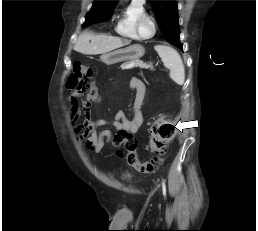
FIGURE 1: Coronal view of an enhanced abdominal CT scan showing a large air-filled thin-walled cavity arising from the sigmoid colon (arrow)

tolerated oral diet, and was successfully discharged three days after presentation.