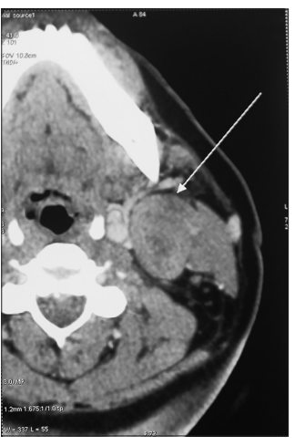
Figure 6: Computed tomography picture reveals necrotic lymphnode

American joint committee on cancer does not have published guidelines for the staging of OMMs. A simple tumor, node, metastasis (TNM) classification of malignant tumors (TNM) clinical staging system for oral mucosal melanoma recognizes three stages and this system has been shown to be of prognostic value.<sup>[14,15]</sup>