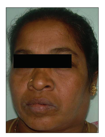
Figure 1: Extra-oral photograph