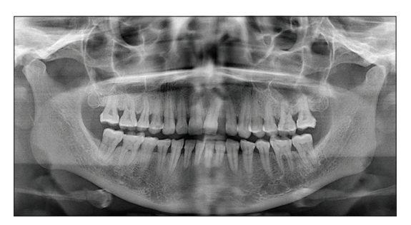
Figure 5: Orthopantomogram showing boneloss in relation to 21 and 22 region