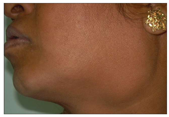
Figure 2: Swelling in the submandibular region