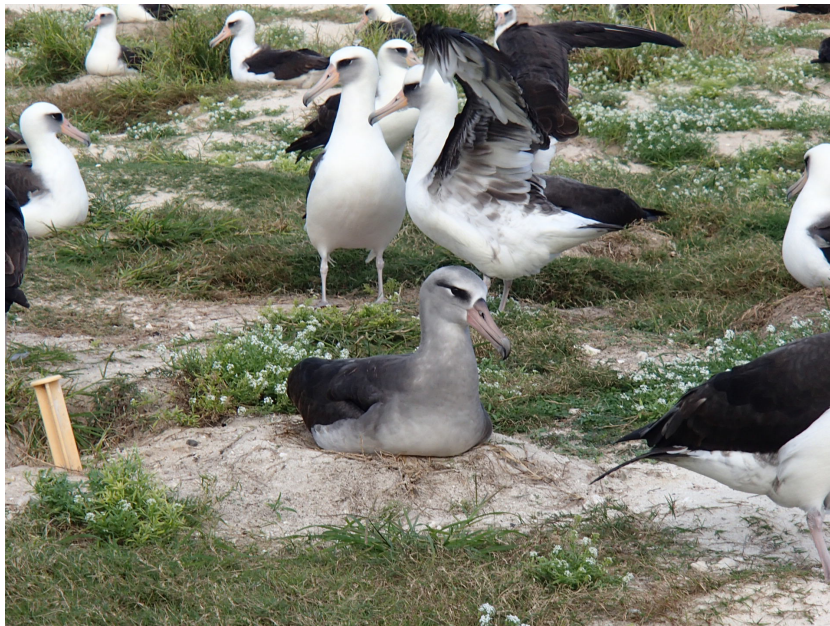
Figure 2 A recently documented hybrid that is mated to a Laysan Albatross and has raised chicks.