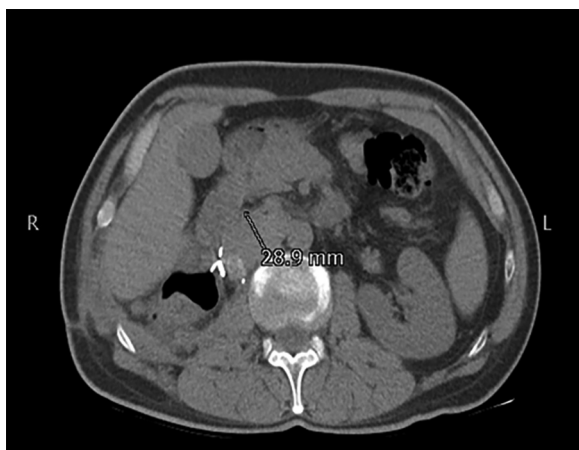
Fig. 2. The CT scan reveals interval follows radical nephrectomy and lymphodec-tomy and increase in caval node at renal hilum on right side measuring 29 mm in short axis. A simple renal cortical cyst evident at the lower pole of the left kidney.

The work has been reported in line with the SCARE criteria [17].