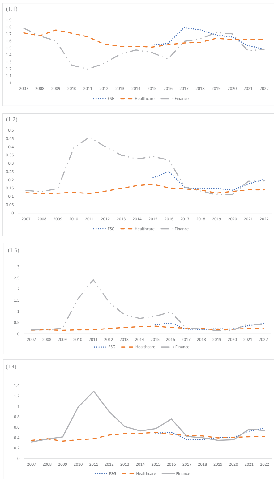
FIGURE 1 The rolling tail risk of environmental, social, and governance (ESG), healthcare, and financial exchange-traded funds (ETFs): (1.1) rolling tail index of ESG, healthcare and financial ETFs; (1.2) rolling tail quantile of ESG, healthcare, and financial ETFs; (1.3) rolling expected shortfall of ESG, healthcare, and financial ETFs; (1.4) rolling expected shortfall conditional upon 25% threshold of ESG, healthcare, and financial ETFs.