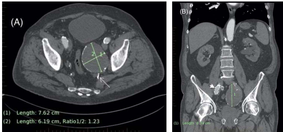
Figure 1: (A) Axial CT demonstrating left internal iliac aneurysm (IIAA) measuring \times 76 62 mm with retrograde flow into the aneurysm (arrow) from the deep pelvic vessels. (B) Coronal CT demonstrating the left IIA with a craniocaudal length of 83 mm. The right external iliac artery endograft limb is also visible (arrowhead).

on post-operative imaging necessitated further intervention. A bifurcated endograft, with bilateral on-table internal iliac artery (IIA) embolizations and limb-extensions into both external iliac arteries (EIA) was planned.