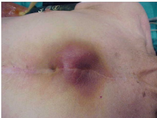
Figure 1 Patient's antero-lateral view showing pulsatile erythematous swelling over the upper third of the sternum.

A preoperative TEE showed a pseudoaneurysm with high flow velocity inside, developed between the prosthesis and the posterior surface of the sternum.