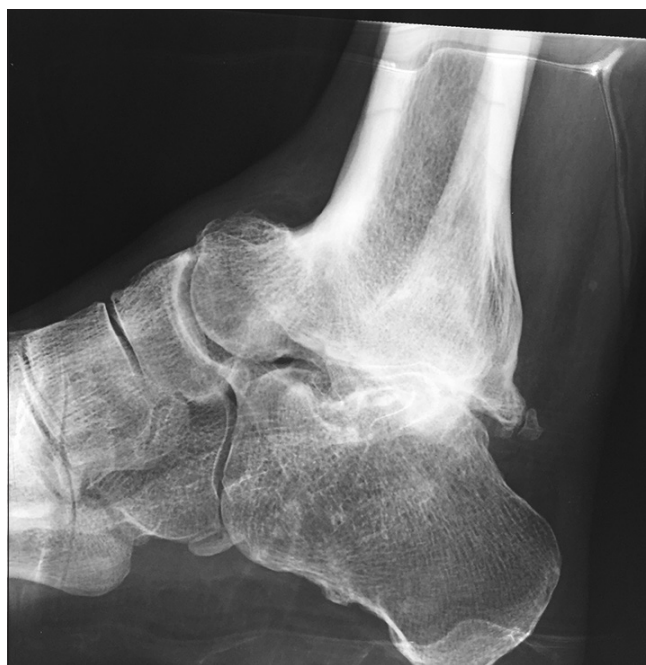
Figure 3: X-ray ankle joint lateral view of 20 year long term followup showing that Blair's Fusion done by excision of talar body and anterior tibial sliding Graft after which the patient recovered and currently is working as a Restaurant manager in Australia