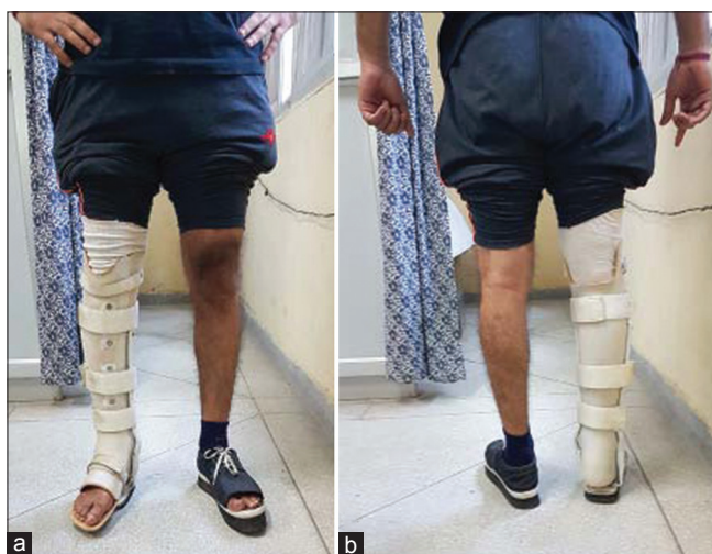
Figure 2: A clinical photograph showing indigenously designed brace used for conservative management of early AVN Talus (a) Front view of leg (b) Back view of leg

Radiographic or clinical progression of disease or incomplete resolution, with absence of significant talar dome collapse, may necessitate surgical treatment; joint-