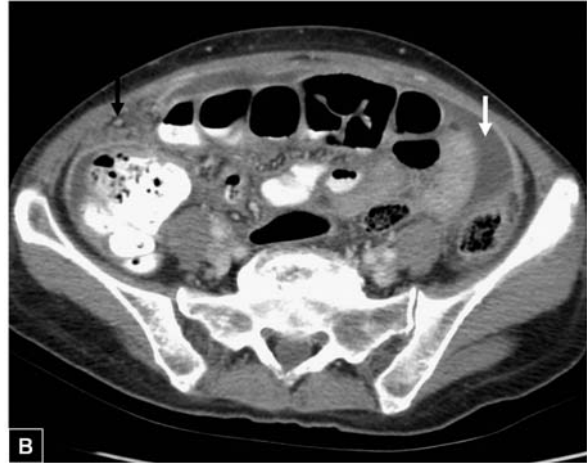
(B) Axial contrast-enhanced CT scan shows the nodules of the omentum (black arrow) and loculated ascites (white arrow).