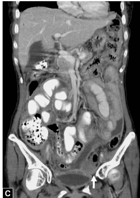
(C) Coronal contrast-enhanced CT scan demonstrates the disproportionate left ovarian mass (arrow) with loculated ascites, in contrast to the usual findings of ovarian cancer.