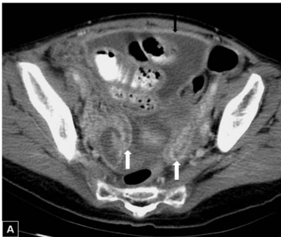
Figure 1: 56-year-old woman had suffered from abdominal fullness for three months. (A) Axial contrast-enhanced abdominopelvic CT scan shows a uniform well-enhanced peritoneum (black arrow), and bilateral dilated convoluted fallopian tubes with intense mucosal enhancement (white arrow) representing bilateral salpingitis; these findings combined with dirty fat strandings identify infection.

had poor appetite, general malaise, nausea and vomiting two weeks earlier, but denied tarry stool or diarrhea. She had lost about 6 kg over 3 months. Abdominal sonography revealed ascites. Laboratory data showed normocytic anemia, with hemoglobin 10.3 g/dL (normal range, 12-16 g/dL), and CA-125 level elevated to 188.6 U/mL (normal range, <35 U/mL). Abdominopelvic CT revealed multiloculated ascites in her abdomen and pelvis, thickened peritoneum, strandings in the omentum, small mesenteric nodules, enlarged mesenteric and paraaortic lymph nodes, prominent ovaries, and dilated fallopian tubes (Figure 1). There was no evidence of soft tissue in the ileocecal region. Under the initial diagnosis of ovarian cancer with carcinomatosis peritonei, she was admitted and exploratory laparotomy was performed. The operative findings included small nodules in the peritoneum, omentum, small bowel loops, uterus, and fallopian tubes and severe adhesions between bowel loops, the left ovary, and the pelvic side wall. The tentative diagnosis was carcinomatosis peritonei, so left salpingo-oophorectomy, enterolysis and peritoneum biopsy was performed.