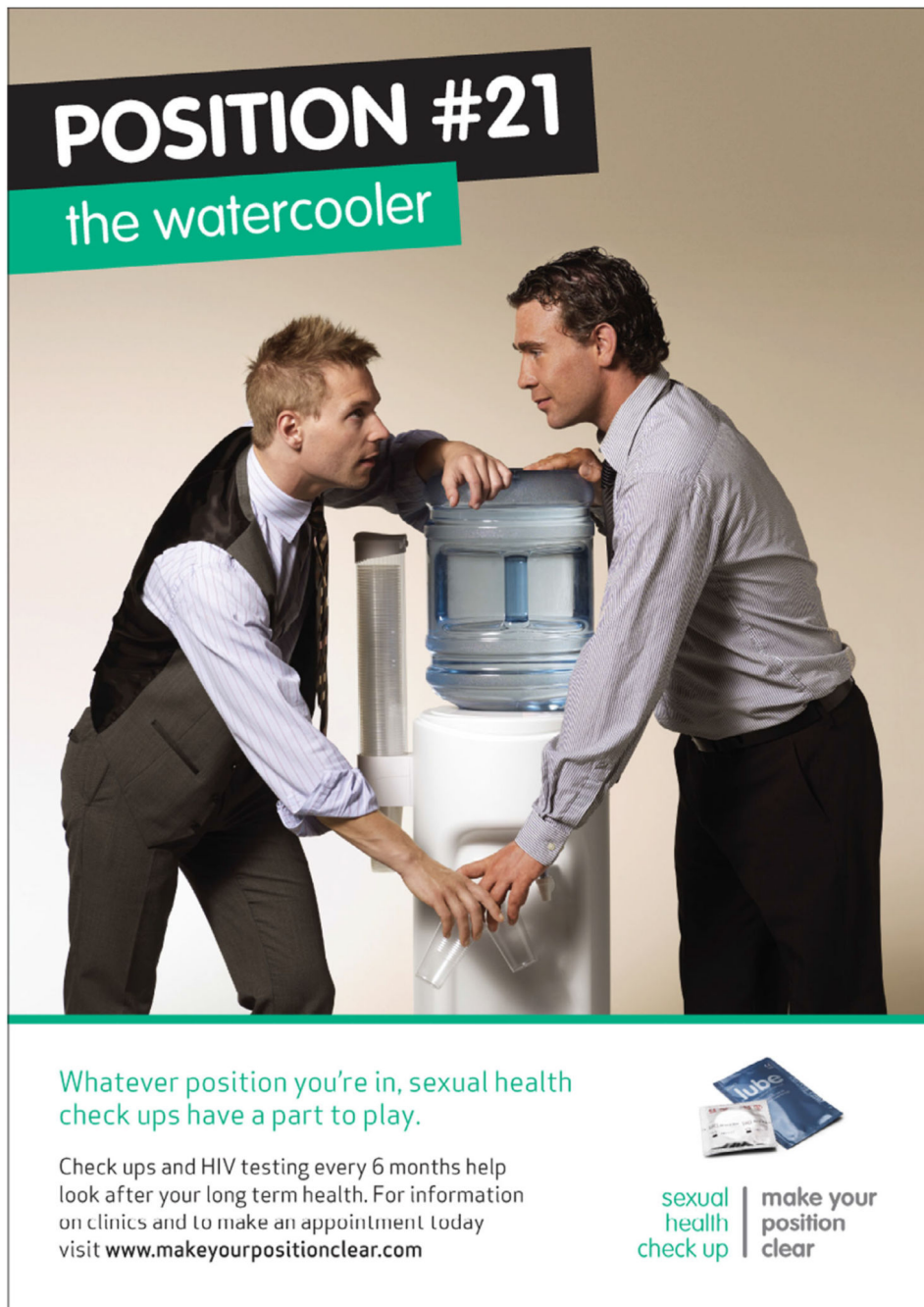
Figure 3. Image from Flowers, McDaid et al. (2013) 'The Watercooler'. [Colour figure can be viewed at wileyonlinelibrary.com ]