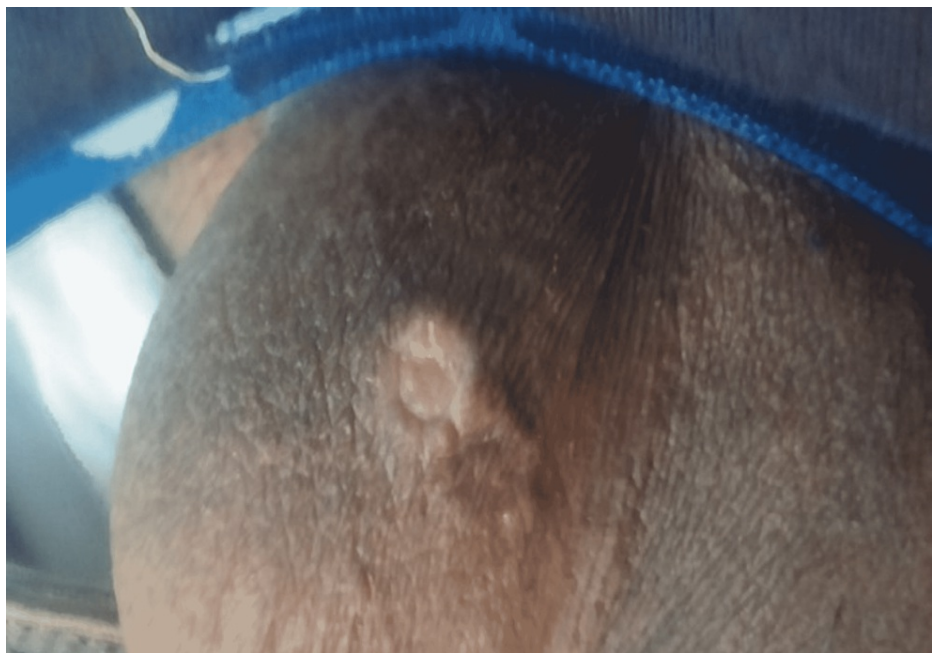
FIGURE 2: Ulcer seen on scrotum

Fundoscopy revealed small hemorrhages in the retina of the left eye. Laboratory investigations revealed anemia with hemoglobin of 10.1 g/dl, hematocrit of 33%, mean corpuscular volume of 73 fl, c-reactive protein (CRP) of 111 mg/l, erythrocyte sedimentation rate (ESR) of 104 mm/h, international normalized ratio (INR) of 1.33, and all other investigations, including liver and renal function, electrolytes, protein levels, viral markers, thyroid and thrombophilia profiles, venereal disease research laboratory test (VDRL), HIV RNA, anti-nuclear antibody, anti-double-stranded DNA, and lipid profiles, were reportedly normal (Table 1).