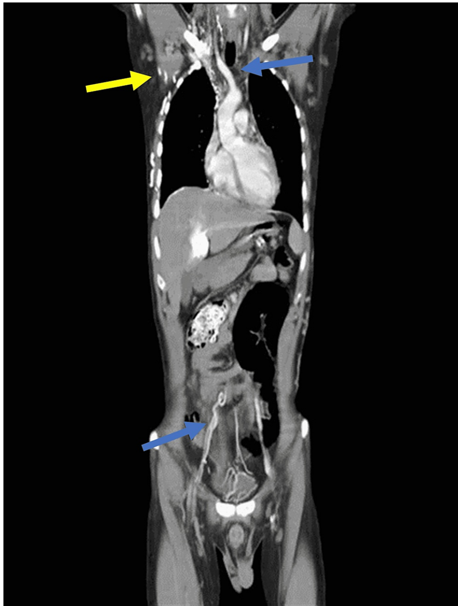
FIGURE 4: CT CAP showing SVC and right external iliac vein thromboses (blue arrows) and collaterals in axilla (yellow arrow)

CT CAP: computed tomography chest abdomen pelvis, SVC: superior vena cava