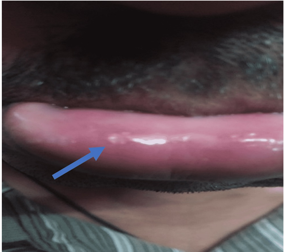
FIGURE 1: Aphthous ulcer on lower lip