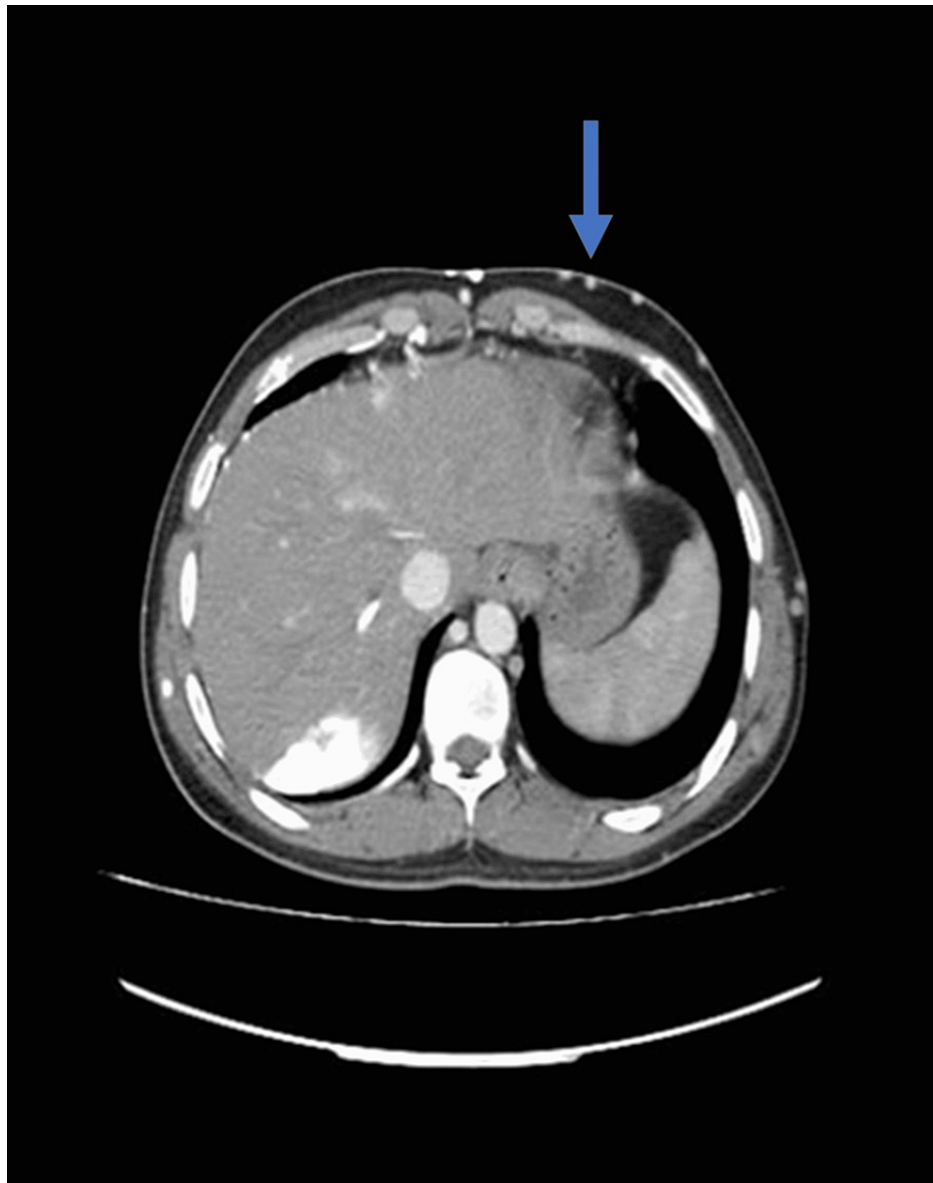
FIGURE 5: CT scan abdomen showing abdominal wall collaterals