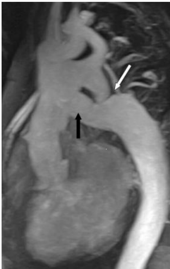
Figure 2 MRA demonstration of aortic CoA (white arrow) and ALSAB graft (black arrow) following the Bentall + ALSAB operation in case 1.

adequate function of both ventricles and a substantial decrease in left ventricular hypertrophy as assessed by echocardiography. It also revealed a good functioning graft.