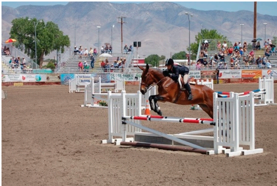
Figure 1. Mules and hinnies can be trained to compete in multiple disciplines, just like horses. The U.S. has seen a growth in mules, hinnies, and donkeys for recreation and competition mounts.

The Equus family includes horses, donkeys, mules, and hinnies. Globally, there are 14 million mules and hinnies—the smallest sector of the equid population (112 million, 50 million horses, and 54 million donkeys) [1]. A mule is the cross between a male donkey, a jack, and a female horse, a mare. The reciprocal cross produces a hinny. They serve important roles as working equids generating critical income and have grown in popularity amongst horse owners looking for recreation and competition mounts worldwide [2–4]. Mules can be trained to compete in multiple disciplines, from dressage, jumping, Western riding, reining, and racing [5] (Figure 1). In the U.S., the mule and donkey population increased from 2007 to 2012 even as the number of U.S. horses and ponies declined [6].