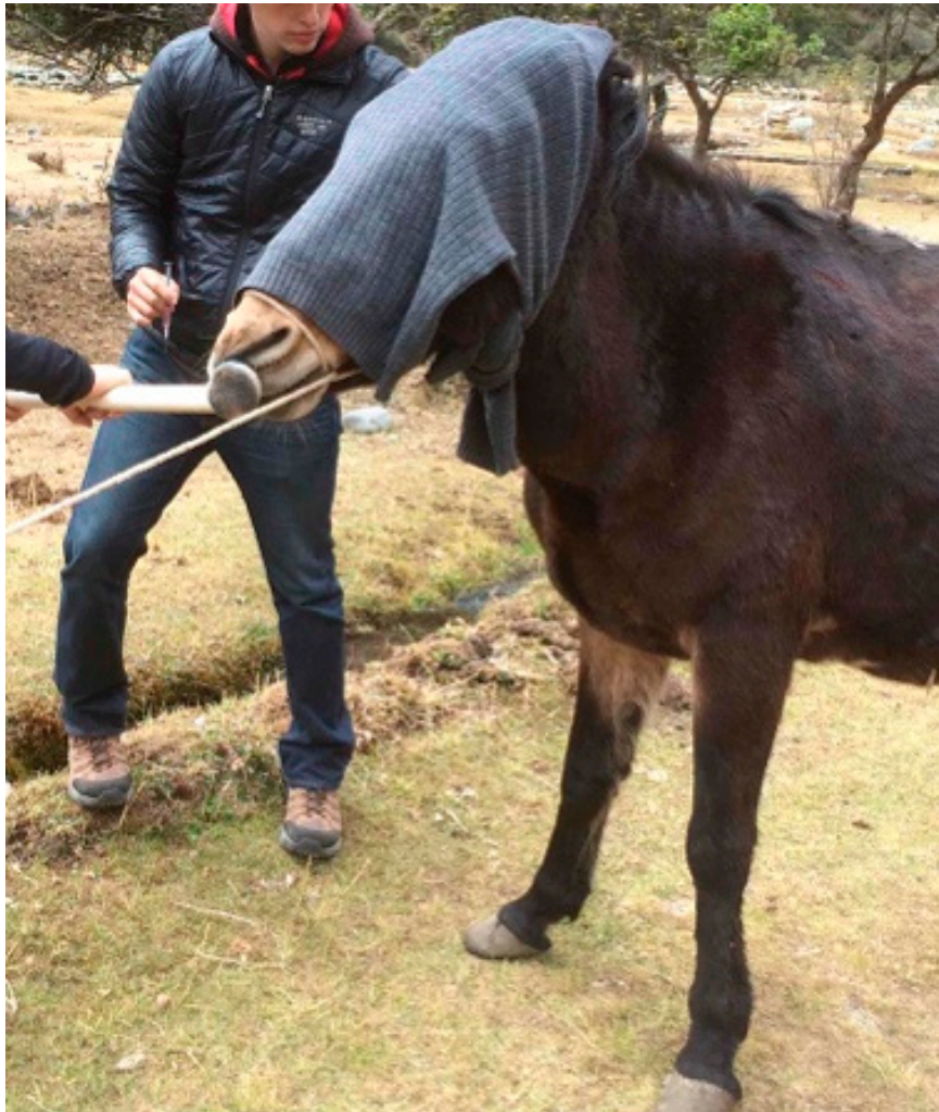
Figure 6. Judicious use of restraints may need to be applied to a fearful mule or hinny when some routine procedures such as administering an injection are performed. A blindfold, possibly in combination with a nose twitch, can help achieve calm administration of a vaccine and create less stress. This does not imply that using restraints is preferable to slow, careful training in more ideal circumstances.

performed elsewhere on the limbs or body. Blindfolds used to cover mules' or hinnies' eyes are effective methods of calming an animal to receive treatment, including deworming or farrier work (Figure 6).