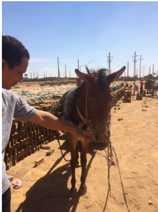
Figure 5. Approach tests in six countries have shown that mules are more accepting of familiar versus unfamiliar people. This makes attempting routine veterinary or husbandry procedures more challenging when treatment is being provided by an unfamiliar person [14,16].

Moreover, such interspecies differences between mules, donkeys and horses may extend beyond the context of spatial cognitive abilities to traits such as trainability and tolerance to humans in either an approach or a contact test by familiar/unfamiliar handlers. Working mules and hinnies that were used to pull loads were less tolerant of an approach by unfamiliar handlers and showed more trust to familiar handlers [10,15,16,32] (Figure 5). Pritchard et al. [16] found that mules being rented for riding purposes in India were likely to be more fearful due to inappropriate handling and compromised welfare. When the animal is rented versus owned, the bond or trust with the owner and mule is likely compromised and the new handler may use harsher methods of handling the mule out of fear [16]. Similar behavior observations have been noted when unfamiliar people are interacting with other animals [16].