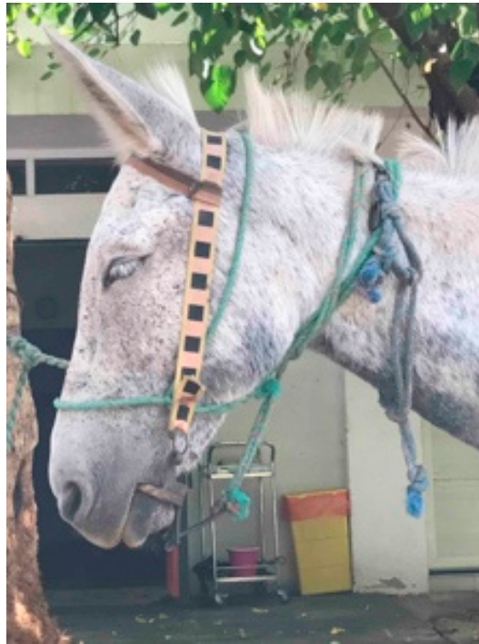
Figure 2. Mules and hinnies are often worked or ridden with harsh equipment to control their behavior such as this ring bit. This can result in lacerated tongues and/or paralysis to the tongue. Improved understanding about learning theory could help reduce the use of such abusive equipment.

related to working with, treating, training, and owning mules and hinnies, especially when comparing them to horses (Figures 2 and 3).