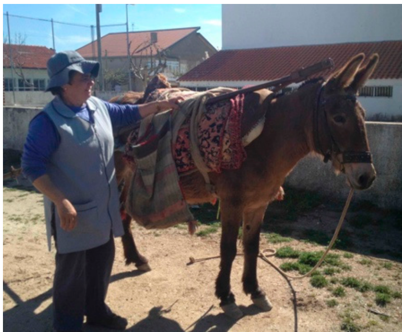
Figure 4. Hinnies are commonly found in many countries where access to mares has been traditionally limited. This particular hinny is used to plow and dig up potatoes and assist with harvesting grapes in Portugal. In some places they are preferred over mules.

To understand preferences for breeding hinnies or owning/working/showing hinnies compared to mules, horses, or donkeys, the authors asked those who are actively breeding and using hinnies to complete a survey. The surveys were conducted with hinny breeders and owners in Colombia, Mexico, Portugal, United States and Spain. The results suggested that hinnies were very sturdy animals, similar to mules, but inherited traits that closely resembled the stallion (e.g., gait of Paso Fino hinnies in Colombia, or conformation of superior Quarter Horses for show hinnies in the U.S.) [14,15,26] (Figure 4).