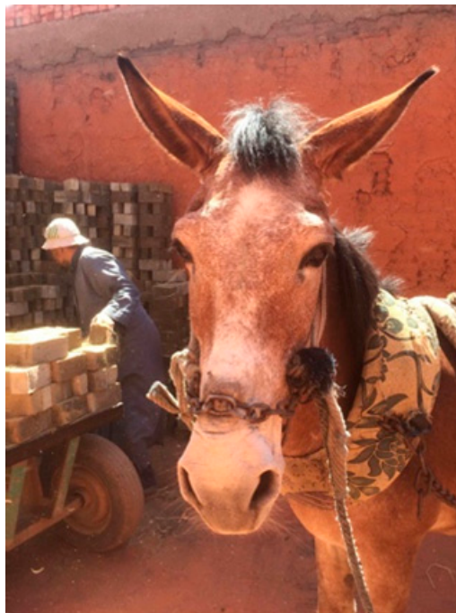
Figure 3. Another example of harsh equipment being used to control a mule working in an Egyptian brick kiln. The chain is purposefully used to create lesions on the nose to sensitize the mule to further pressure. Improved understanding of mule behavior would decrease the need for abusive tools such as this.