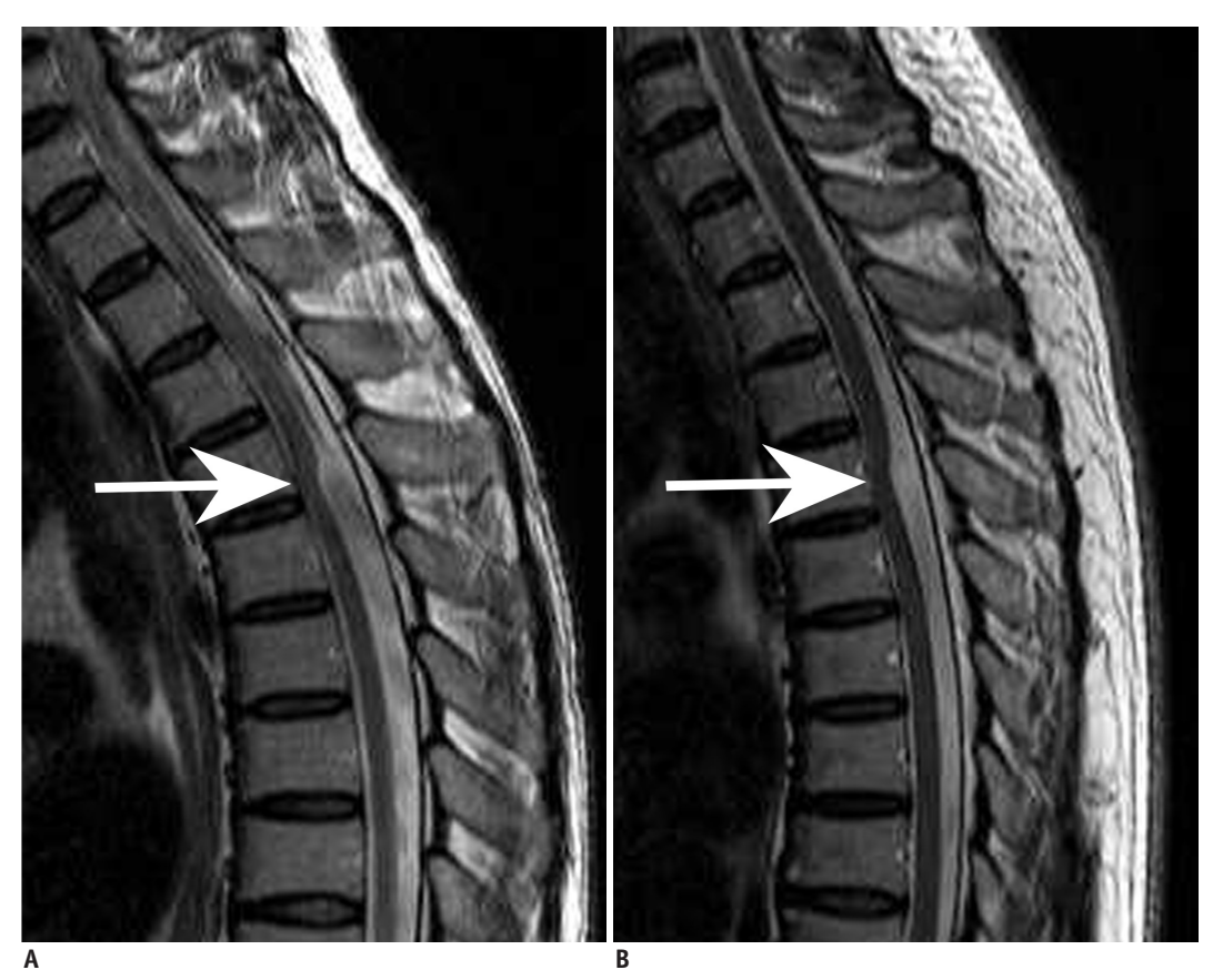
Fig. 1. Whole-spine sagittal T2-weighted images show incidental findings of focal anterior displacement of thoracic spinal cord in two patients.

A , B . Asymmetric dented appearance with ventral angulation of cord and widening of dorsal cerebrospinal fluid (CSF) space are present without intradural mass or spinal cord herniation in upper thoracic spine. Prominent CSF flow artifacts are present in posterior subarachnoid space at involved spine level. Arrow indicates spinal cord.