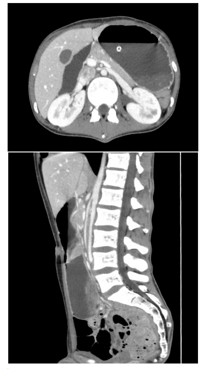
Figure 1. Abdominal CT scan (sagittal and axial plane) – the duodenum is compressed between the aorta and the superior mesenteric artery (aortomesenteric angle less than 14°).

Over six months, the patient lost 7 kg of body weight and his body mass index (BMI) dropped from 14.88 kg/m<sup>2</sup> to 12.46 kg/m<sup>2</sup>. A nasojejunal tube was inserted to provide enteral nutrition but was dislocated. An abdominal CT scan ( Fig. 1 ) showed dilatation of stomach caused by superior mesenteric artery syndrome (SMAS or Wilkie's syndrome). This occurs when the aortomesenteric angle decreases to less than 14°. The patient refused both surgical treatment and jejunostomy insertion. Considering this, home parenteral nutrition (HPN)