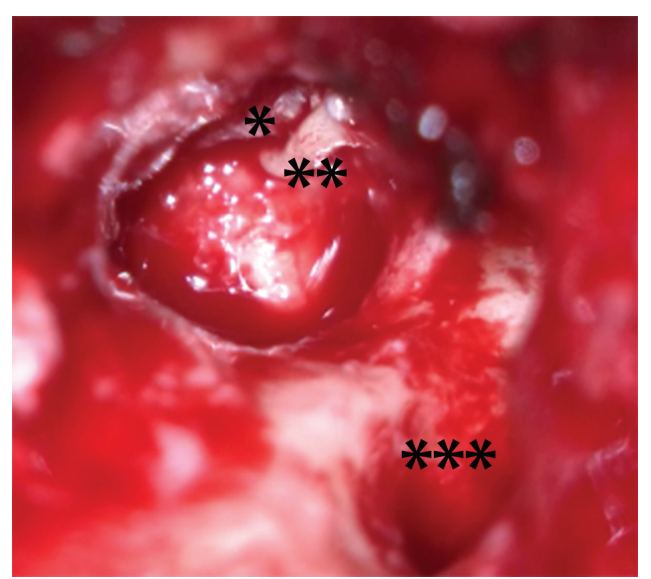
Figure 1. This figure shows a large mastoidectomy cavity; *indicates tympanic membrane remnant, **manibrium mallei, and ***mastoidectomy cavity.

After conchal/tragal cartilage and temporalis fascia were harvested. CWD mastoidectomy was performed when the presence of the extensive cholesteatoma could not be completely cleaned by CWU technique. Sodium 2-mercaptoethanesulfonate (MESNA, Ureomitexan®, Baxter oncology, Germany) which is a synthetic sulfur compound that produces mucolysis by splitting the disulfide bonds of the mucous polypeptides, was used for some cases to remove cholesteatoma matrix totally from the operative field. MESNA can disrupt the disulfide bonds of keratin which is the main component of cholesteatoma matrix and can facilitate the dissection of the cholesteatoma matrix totally. During the surgery; MESNA was diluted with saline (20% MESNA and 80% saline) and applied after cholesteatoma debris was aspirated but still a remnant of cholesteatoma matrix was left behind. The disulfide bonds of the cholesteatoma matrix are considered to be disrupted by MESNA approximately 5 minutes after application. All infected air cells were drilled and the cholesteatoma matrix was tried to be removed as a whole (Figure 1). Hemostasis was achieved and small pieces were prepared from the whole big cartilage harvested from the conchal or tra-