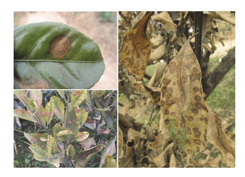
FIGURE 1: Symptoms of citrus target spot caused by Pseudofabraea citricarpa .

differentiation of Ps. citricarpa from other fungal pathogens of citrus.