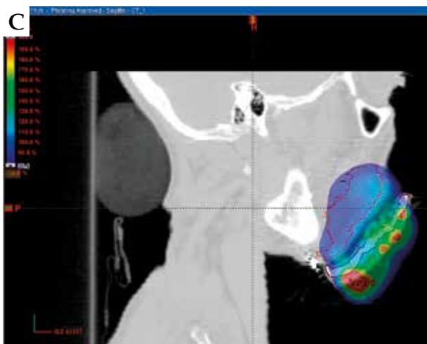
Fig. 2. A) Dose wash showing buccal mucosal lesion coverage by prescribed isodose. B) Dose wash showing lip lesion coverage by prescribed isodose. C) Dose colour-wash showing lip lesion coverage by prescribed isodose