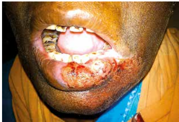
Fig. 4. Early reactions noted at three weeks post radiotherapy