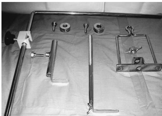
Figure 1. Disassembled apparatus of the mechanical hernia retractor.

Statistical analysis was done using SPSS 7.5 software ( Table 1 ). The various parameters studied and compared were operative time, postoperative pain, hospital stay, time taken to return to work, and cosmetic appearance.