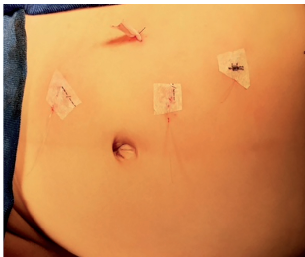
Figure 2 - Trocars position - postoperative period.

Position of the trocars - right pyeloplasty, one 5mm port to the telescope placed above and lateral to the umbilicus on the side of the affected kidney and three 3mm trocars to the instruments.