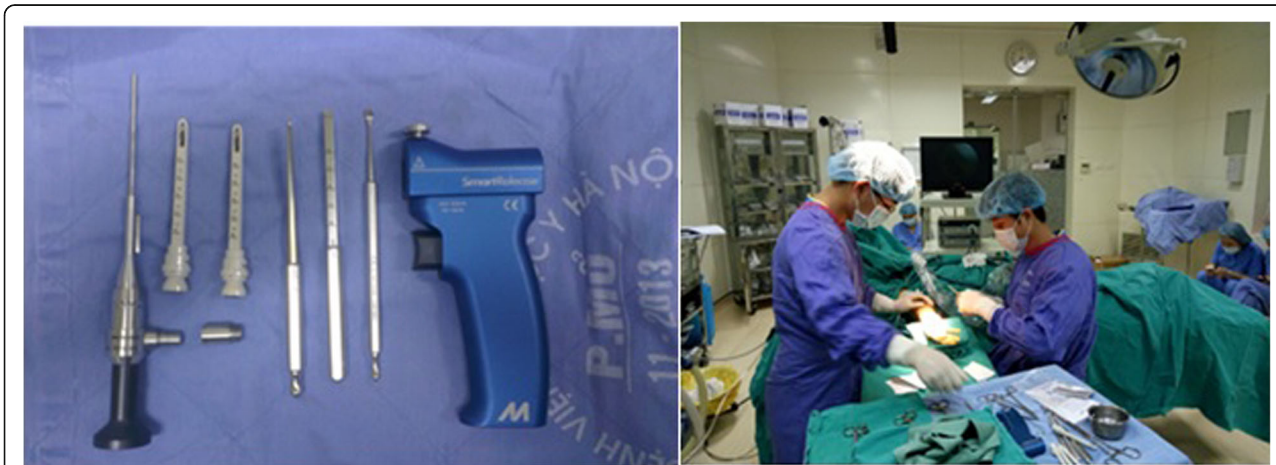
Fig. 1 Surgical instruments and patient's position

Preparation: Basic hand surgery set, endoscopic carpal tunnel release system (MICROAIRE) with a 3.0-mm eyepiece endoscope connected to a standard camera connector, camera, light source, and pneumatic tourniquet. Operations were performed under block and local anesthesia with the use of 20 ml of 1% solution of marcaine Fig. 1.