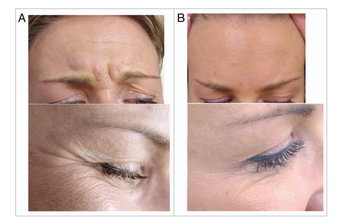
Figure 3. Patient showing glabellar and crow's feet wrinkles. (A) pre-injection, (B) after injection with botulinum toxin.

LD50, so that the FDA classifies BTX-A as the rapeutically safe. ^{183} BTX-A does not cross the blood-brain barrier or pass through the skin. ^{179}