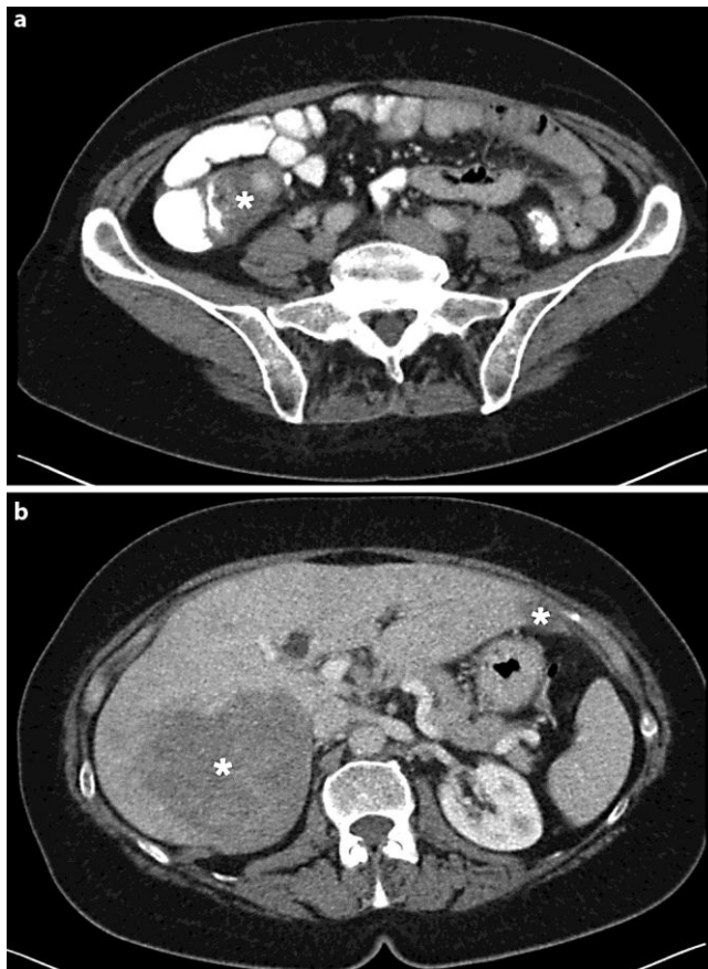
Fig. 1. Computed tomography image showing primary carcinoid tumor encasing the terminal ileum (asterisk in a ) and its hepatic metastasis in segments 3 and 6 (asterisks in b ).