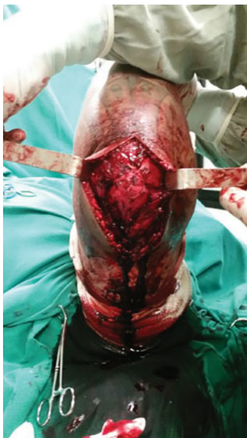
Fig. 3 Final configuration of the reinforcement made with long palmar muscle tendon graft.