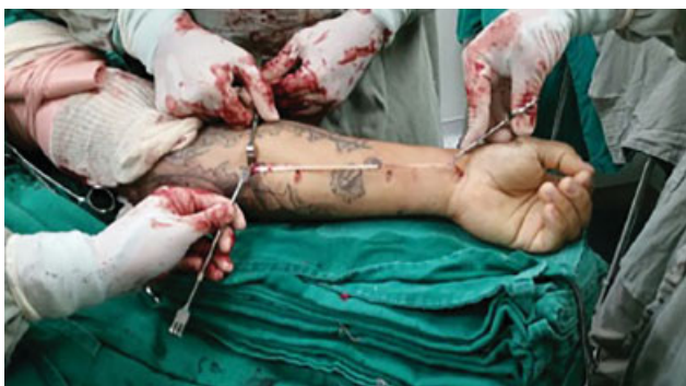
Fig. 2 Graft removal (long palmar muscle tendon).