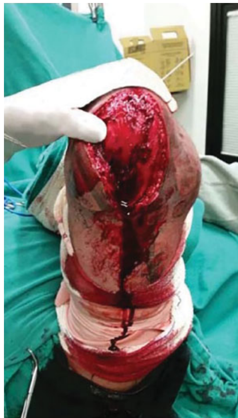
Fig. 1 Posterior surgical approach.

The patient was evaluated using an isokinetic dynamometer (CybexII+, New York, NY, USA) both preoperatively and 5 months after surgery. Flexion-extension was evaluated. The right arm was used as the control side.