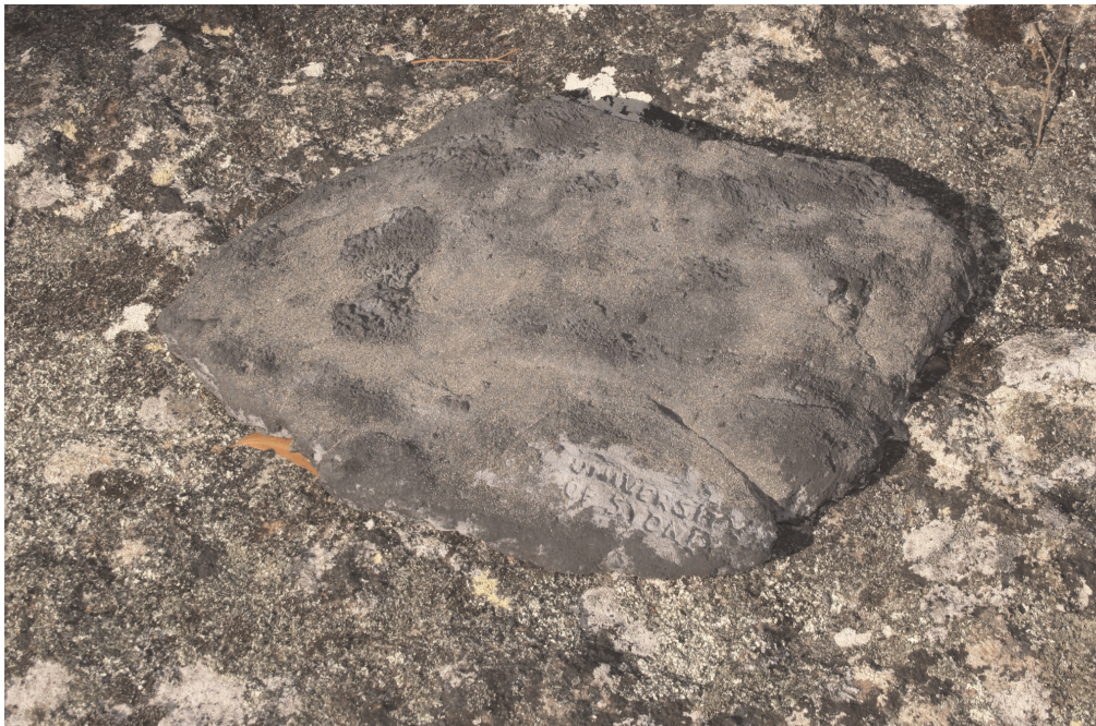
Figure 1. An artificial rock on site. Artificial rocks were designed to provide crevices with attributes preferred by saxicolous reptiles. All rocks were placed on flat ground to provide crevices 4 to 11 mm high, in areas with open canopies overhead and on the western side of the outcrops to allow relatively high sun exposure (and thus, favorable thermal regimes). doi:10.1371/journal.pone.0037982.g001