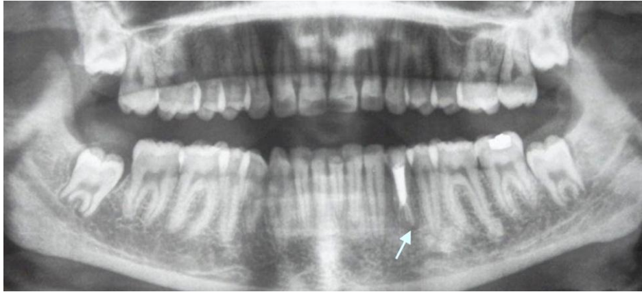
Figure 3. Panoramic view showing obturation of unilateral three rooted mandibular left first premolar

Maillefer, USA) using AH Plus sealer (Dentsply, Maillefer, USA) (Figures 1C and 1D).