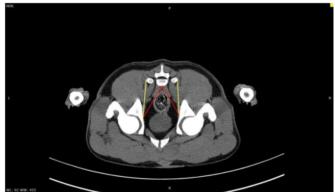
Fig. 1. Measurement of Levator ani and coccygeus muscles in the cross-section computed tomography image. Red line: levator ani muscle; Yellow line: Coccygeus muscle.

VE40A Software (Siemens AG; Munich, Germany), with window width 342 HU and window level 56 HU. To measure both muscles, CT images at the level of 1 st caudal vertebrae were used. The images were adjusted in the multiple planar reconstructions (MPR) to have a final symmetrical transverse plane by focusing on a subjective symmetrical appearance of the vertebra and pelvic bones. When the transverse process was completely visible, the coccygeus muscle's measurement line was drawn from the ischiatic spine with a perpendicular angle to the center of the femoral head and it was ended at the tip of the transverse process of the 1 st caudal vertebrae bilaterally. The measurement line for Levator ani muscle was started from the ischiatic spine and ended at the ventral aspect of the 1 st caudal vertebrae (Fig. 1). The experimental protocols regarding the care and handling of dogs were approved by the Ethics Committee of Faculty of Veterinary Medicine, Science and Research Branch, Islamic Azad University, Tehran, Iran (IR.IAU.SRB.REC.1396.022).