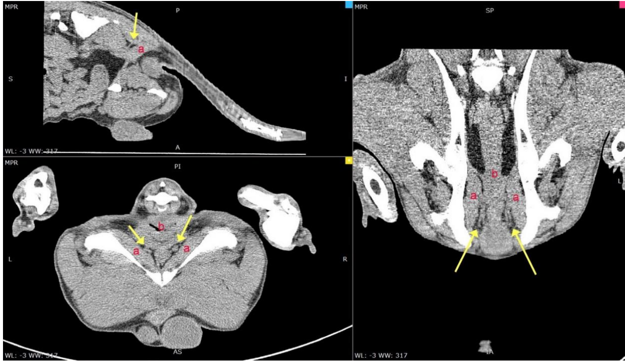
Fig. 2. Reconstructed computed tomography images. a: Coccygeus muscle; b: Rectum; Arrow: Levator ani muscle.

The coccygeus muscle appears as a thick muscle located laterally to the levator ani muscle and it was visible at the level of hip joint and second caudal vertebra at cross-section view. It originated from the medial shaft of ilium and ended at the transverse process of 2 nd caudal vertebrae (Fig. 2). The mean length of coccygeus muscle in our CT images was evaluated 4.63 cm and 4.35 cm in males and females, respectively (Table 1). The study showed statistically significant difference between males and females regarding length of both muscles ( p < 0.05 ).