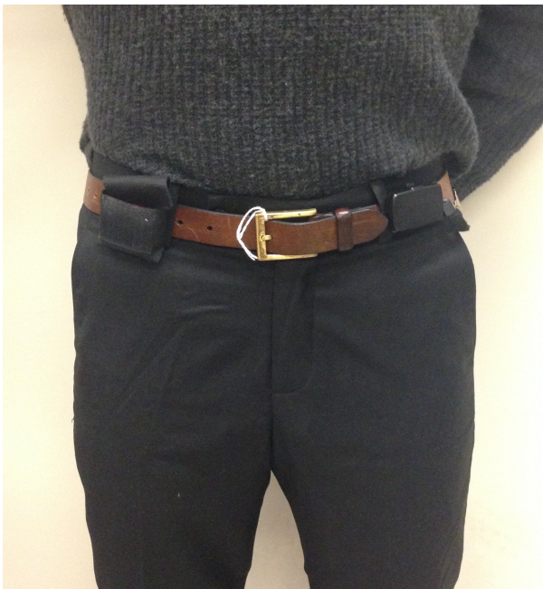
Figure 1. Activity monitor placement with the PiezoRx and the ActiGraph accelerometer positioned on the participants left and right hip respectively.

All participants completed the CSEP-PASB-Q prior to physical testing (12). Physical fitness was evaluated using measures of anthropometric, musculoskeletal and aerobic fitness by CSEP-Certified Exercise Physiologist candidates. Testing protocols were completed according to published guidelines (5, 15). Anthropometric measures collected included height (cm), weight (kg), and waist circumference (cm) taken using a standard anthropometric protocol (5) to calculate body mass index (BMI). Aerobic fitness was assessed through 6-minute walk test or modified Bruce maximal or submaximal treadmill protocol; depending on existing health conditions. Muscular fitness was assessed through grip strength, pushups, vertical jump without countermovement but with arm-swing, and 30 second sit-to-stand. Grip strength was calculated by adding the right and left hand scores for a total score. Relative vertical jump power was calculated using the Sayers equation and dividing by weight. Sayers equation: Power (W) = [60.7 × vertical jump displacement (cm)] + [45.3 × weight (kg)] - 2055.