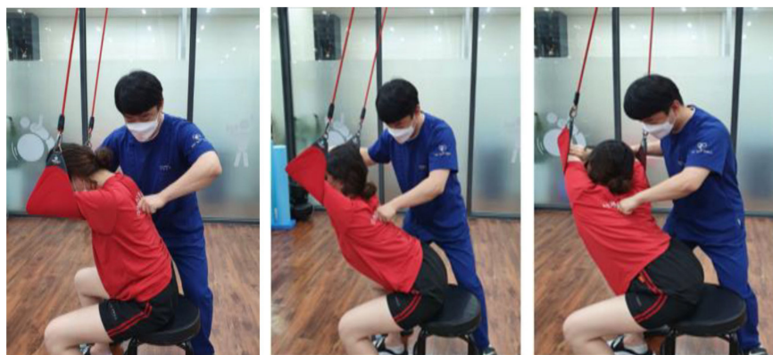
Figure 2. Thoracic active exercise with a sling.

exercise presented in the Neurac1 Seminar Workbook [28], and the procedure was as follows (Figure 2).