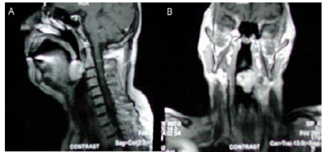
Figure 2 Figure 2a and 2b. Magnetic resonance images of head and neck showing the laryngeal mass